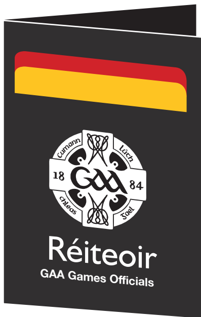
PVC Referee Wallets with Red and Yellow Card